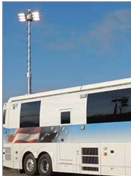
Night Scan® Command Center Application