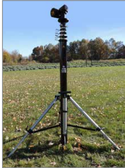
Hurry Up Portable, Pump Up Mast