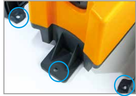
Stability peg holes